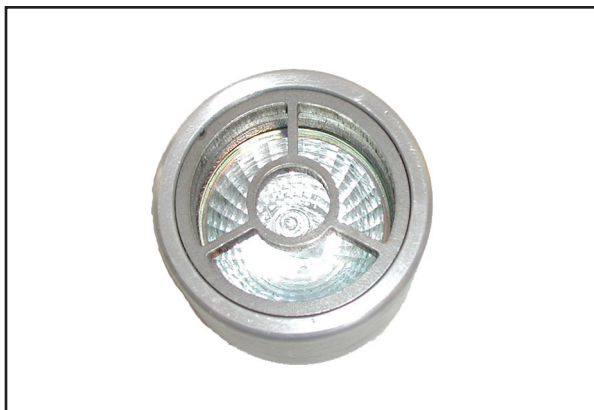
X-10 light assembly