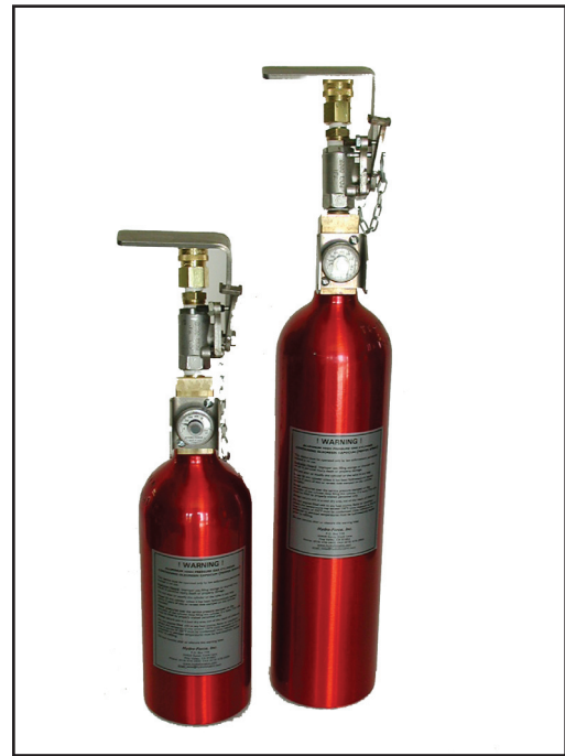
1-liter and 2-liter chemical cylinders

Two chemical cylinder sizes can be utilized with the X-10 Extension Probe. The standard X-10C Chemical Cylinder provides 1-liter chemical capacity. A 1-liter bottle will provide about 13 bursts of chemical, each containing about 7 grams of Oleoresin Capsicum (Pepper Spray). The 2-liter bottle provides approximately 25 bursts of chemical, each containing about 7 grams of Oleoresin Capsicum. The 1-liter bottle is recommended for most extraction activities when only one cell is involved. The 2-liter cylinder may be more appropriate when there are multiple extractions or when using the hand-held sprayer.